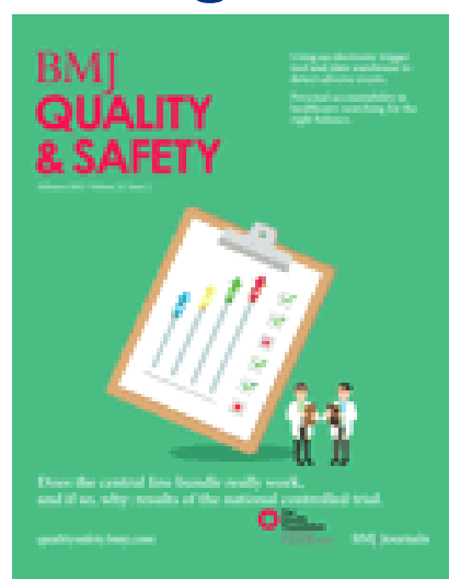
BMJ Quality & Safety