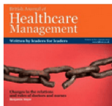
British J. of Healthcare Management